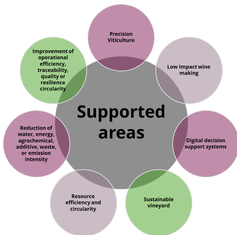
Figure 2 LIGAWINE support areas

The Open Call focuses on applied innovation, pilot validation, demonstration, deployment, and market-oriented adaptation. Basic research activities are not within the scope of the Open Call. Selected sub-projects should contribute to one or more of the areas presented in Figure 2.