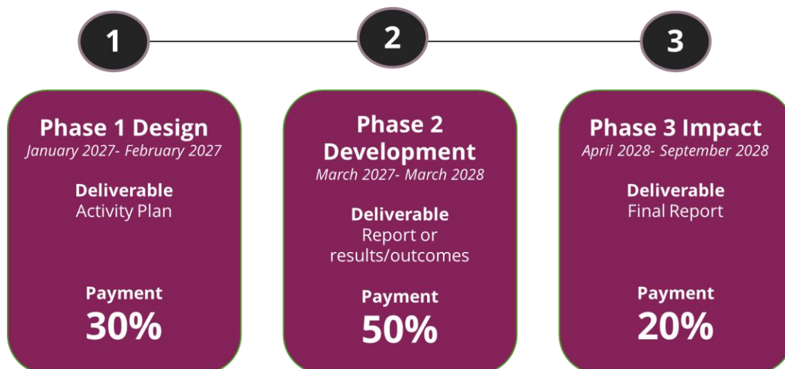
Figure 4 LIGAWINE Open Call Implementation Phases